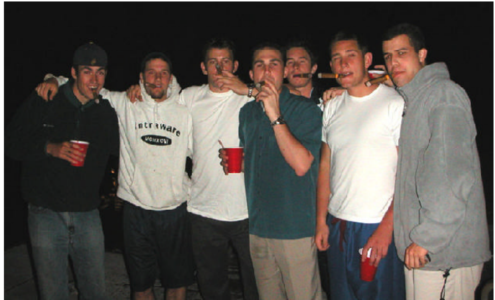
Dubious Fiji's (above) light up a cigar to celebrate Cal's win over Oregon. Many actives traveled to Eugene for the weekend to see the Bears win.