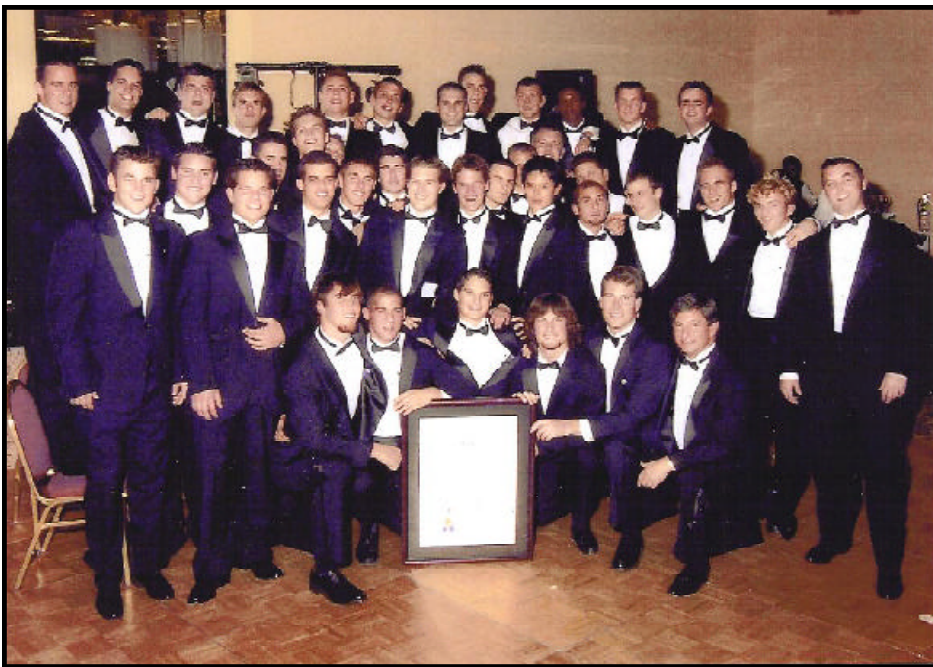
image for fraternities at Cal. One that would have the outside world to take note, be viewed positively and admired as the ideals of the fraternity were brought to the forefront. They have succeeded tremendously!

Our new members celebrate their Charter. See more pictures in the photos/Spring 2002 section at www.CalFiji.org .