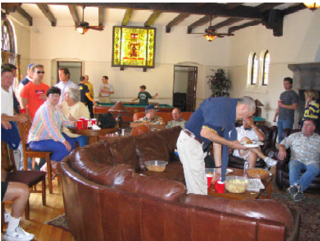
Fiji's young and old hanging out at the house before Cal football games (above) and having dinner after the golf tournament (below).