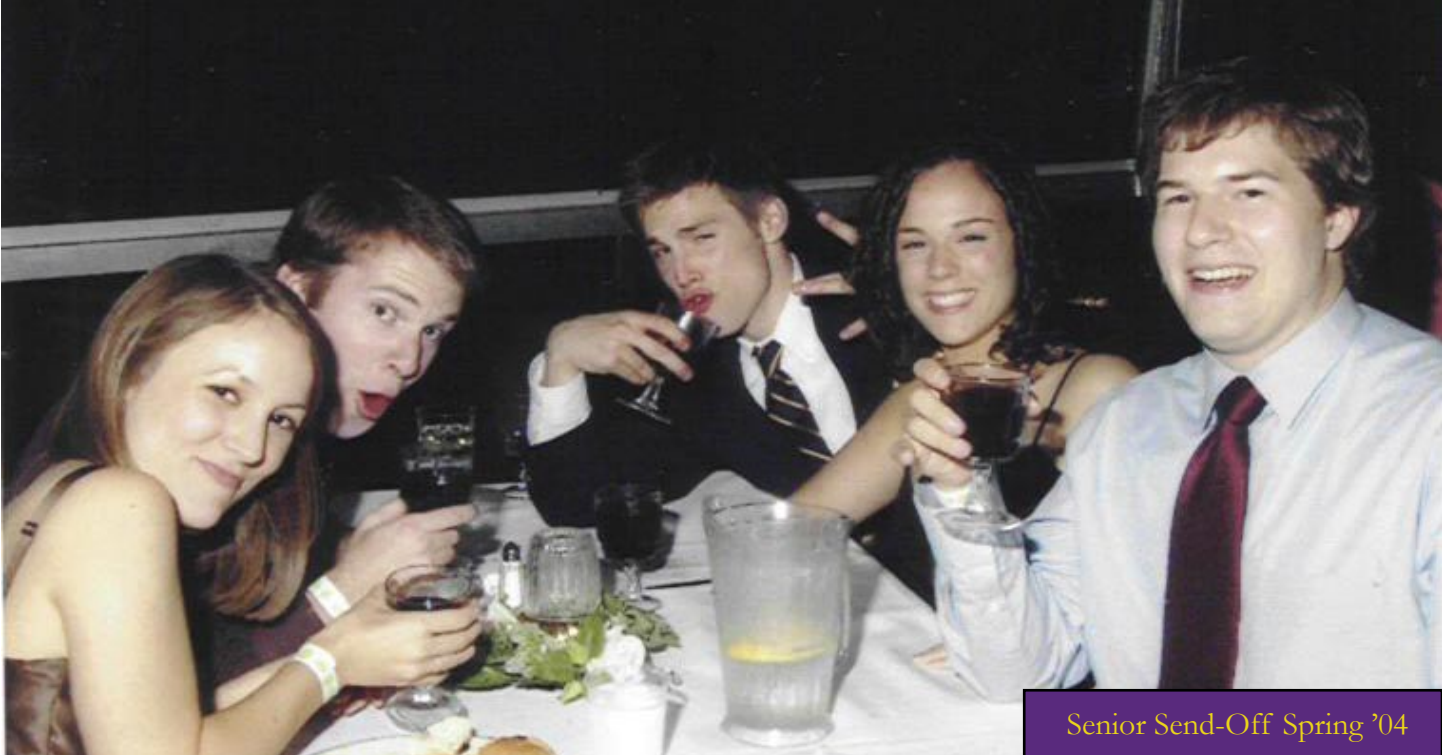
Senior Send-Off Spring '04